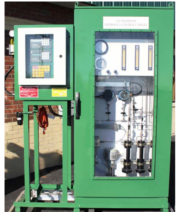
*Glass door is for marketing purposes only